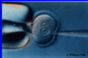
Cloning: Ethical Issues and Future Consequences