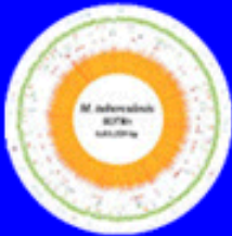
Entire Genetic Code of a Bacteria