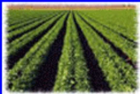
Plants of Tomorrow