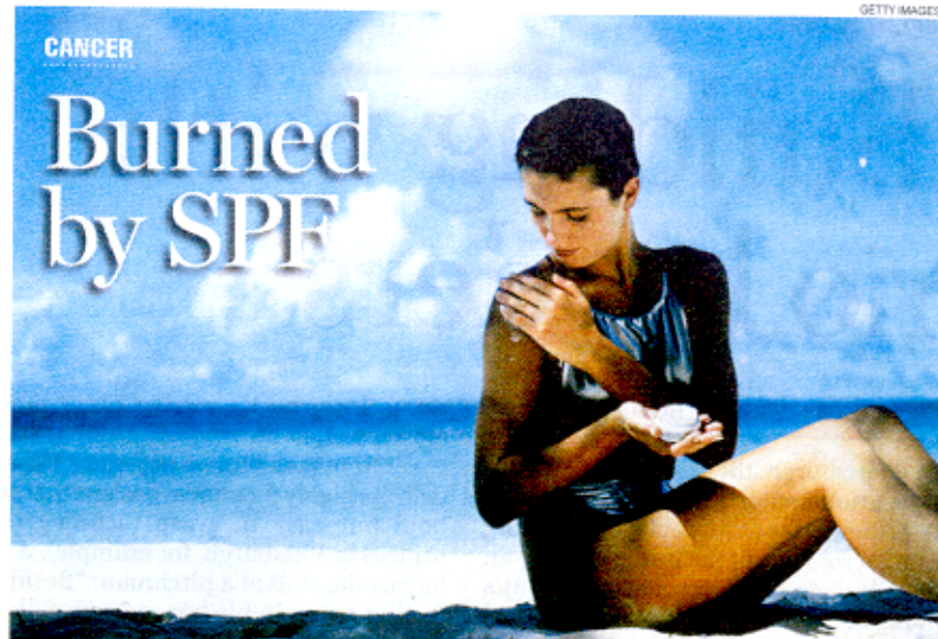
CATCHING RAYS. SPF numbers don't rate sunscreens' ability to block harmful UVA light.