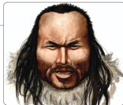
RECONSTRUCTED: Ancient DNA provided details about the looks of a man who lived in Greenland more than 4,000 years ago.

Practical considerations may be what delays deployment of any but the simplest forensic kits, though. "The forensic field is very, very conservative," Podini says,