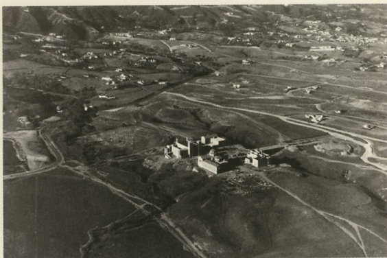
(Above left) When UCLA came to Westwood, shown here in 1930, there were 18,000 farms in Los Angeles — and the new university boasted an agricultural college and citrus/avocado orchard. (Above right) Today, the same view yields a picture of a densely populated, urban environment — and no orchard.